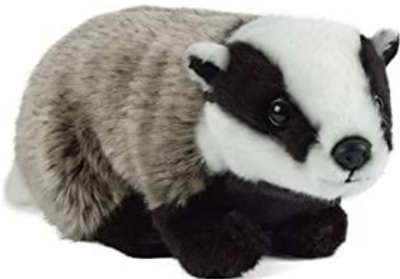
WINNER - Montessori