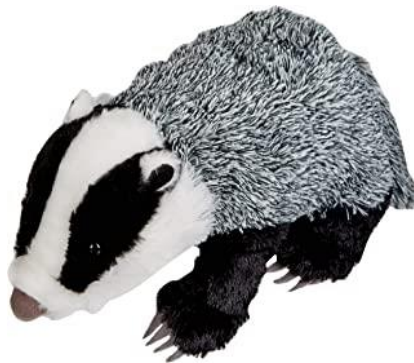
WINNER - Einstein