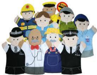
People Who Help Us