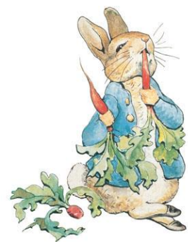
In the Garden