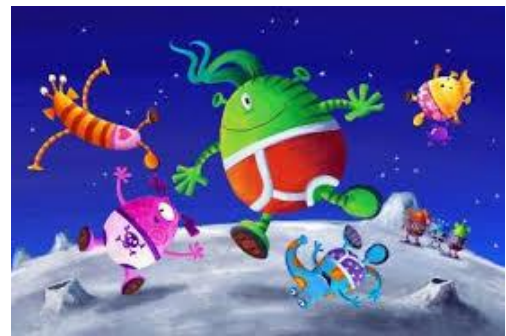
Aliens Love Underpants